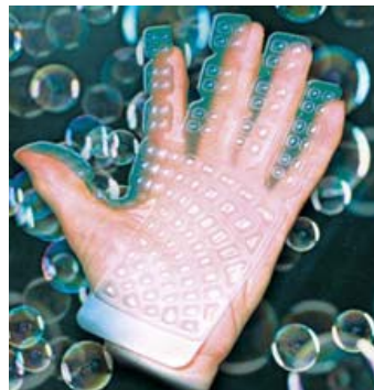
Workers should use ISO/ANSI certified anti-vibration gloves